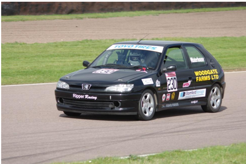
Paul Waterhouse AFRC Champion 2017