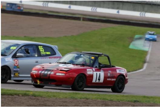
Double driver Team 14

By lunchtime there had been some heavy showers in dispersed with bright sunshine and as the cars were being prepared, again the clouds were starting to build and at one point it looked like the heavens would open, but only a few drops of rain fell in the entire race. The race would be a 45 minute race with a 60 second wheels stopped pit stop. Each stint would gain a Performance Index (PI) result, enabling drives to gain a PI score even if they fail to complete the full distance. Additionally this allows a two driver team to enter either with two cars (eg Team 51) or one car and two drivers (eg Team 14). After their hectic time at Cadwell Park Team 14 of