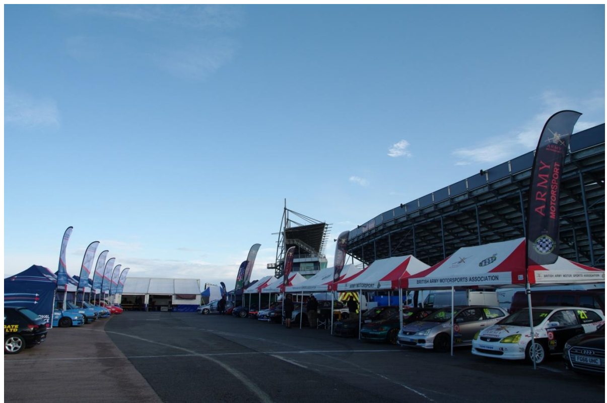
The AFRC Paddock